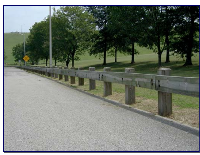
Osmose® Wood Products Licensed Manufacturer Since 1955